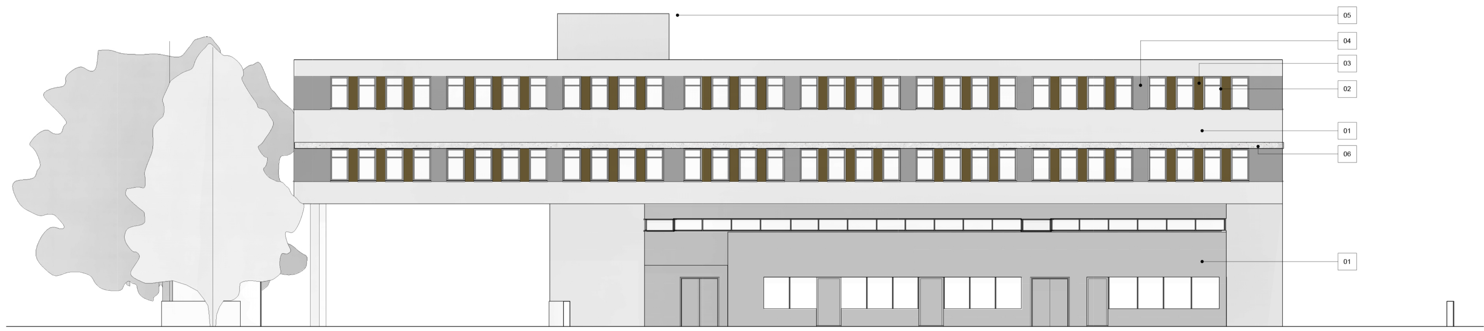
02 PROPOSED SOUTH ELEVATION 1 : 100