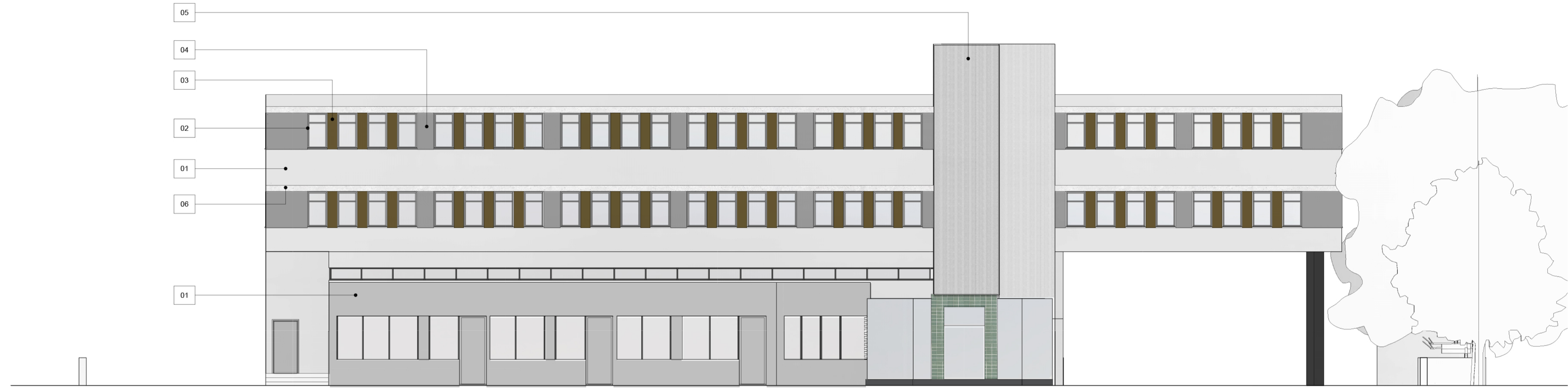
01 PROPOSED NORTH ELEVATION 1 : 100

DRAWING NO. 50026 Issued 20.10.20 Revision A